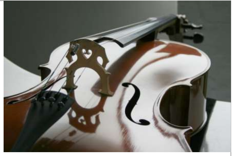
"Miss October" - Sasha Routh's beautiful 'cello features in the 2009 calendar.