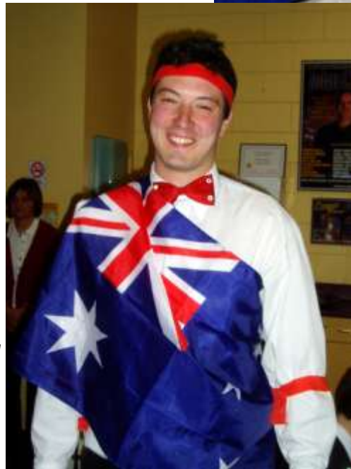
The Green Room at Half Time: the orchestra dresses up (some less patriotically than others).

first half, the orchestra returned for the second half of the concert draped in flags (including, it has to be said, Dutch and Australian ones—where is the patriotism, folks?!) colourful outfits and unusual hats, while one percussionist had sprouted a crop of hair that should have sent him back to the chemist for a refund.